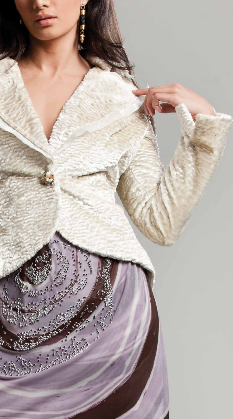
Retro Bead Dress TR016 Pearl Heart Blazer AM020