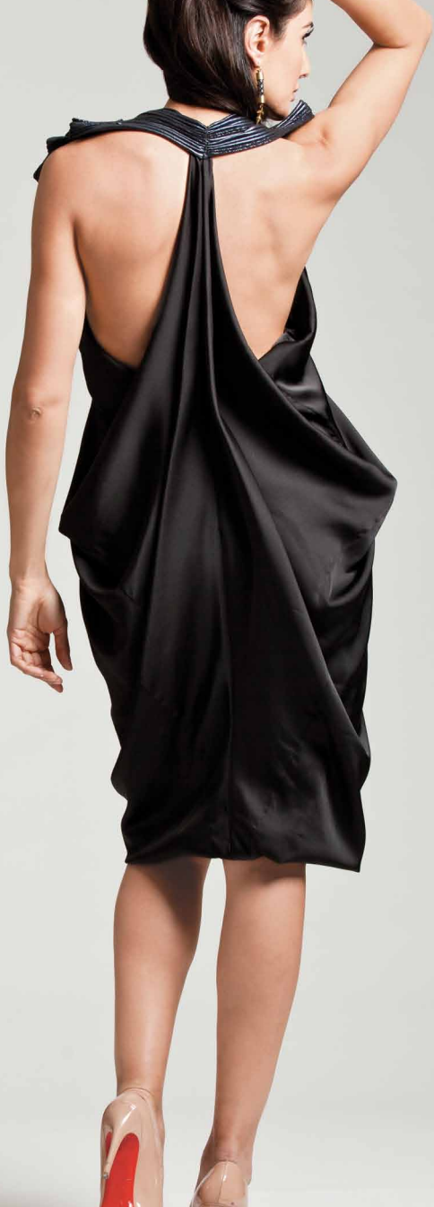
Bit Dress TRO15