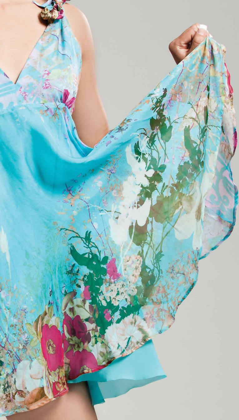
Dahlia Dress AM038-TR