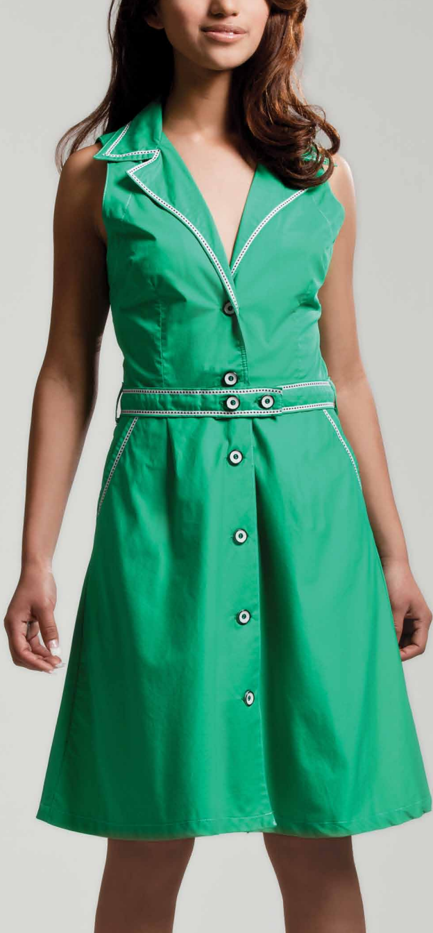
Apron Dress DC0007-VD