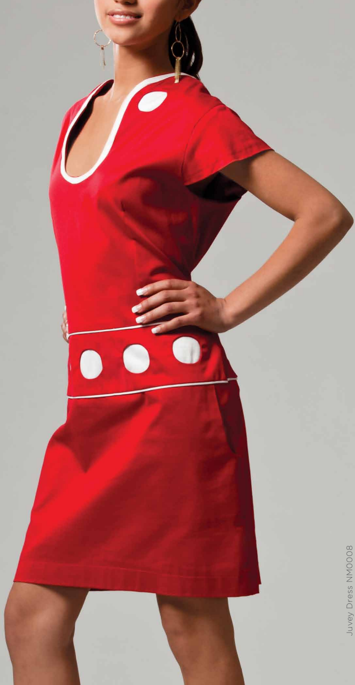
Juvey Dress NM0008