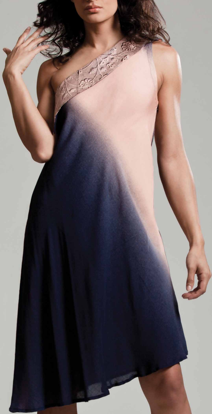
Asymmetric painted dress TR003